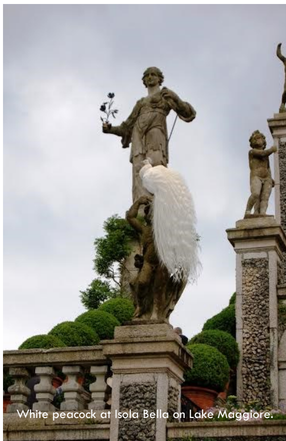
White peacock at Isola Bella on Lake Maggiore.