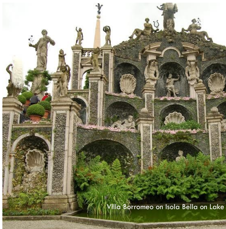
Villa Borromeo on Isola Bella on Lake