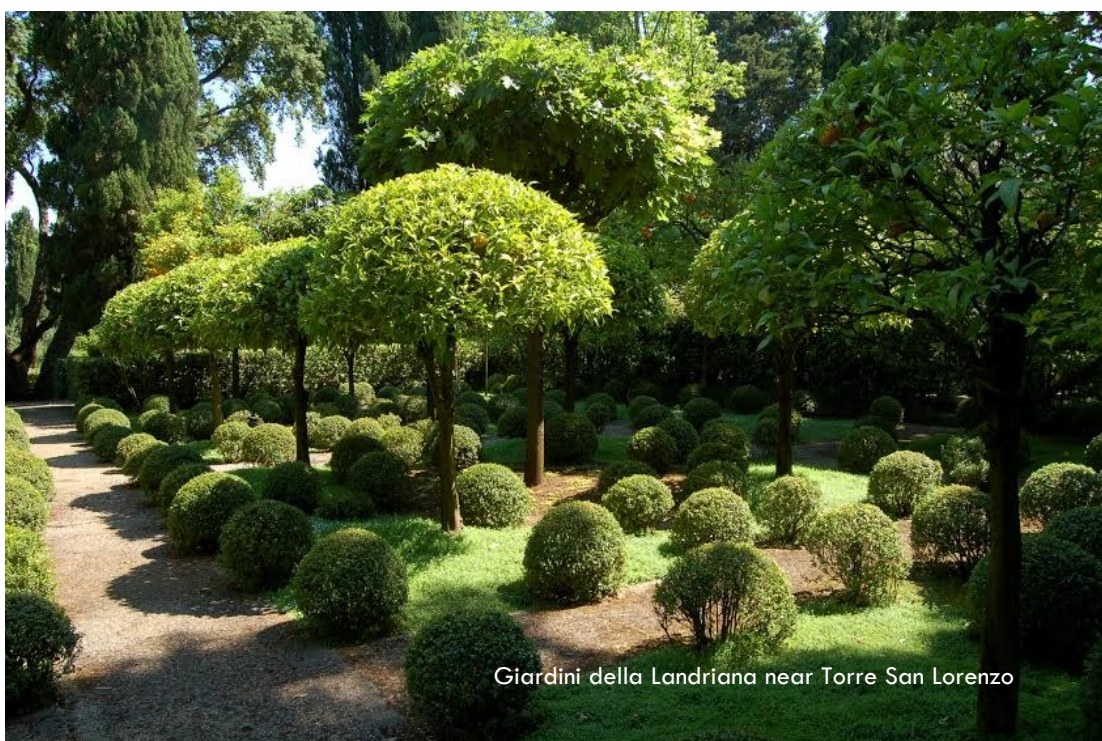
Giardini della Landriana near Torre San Lorenzo