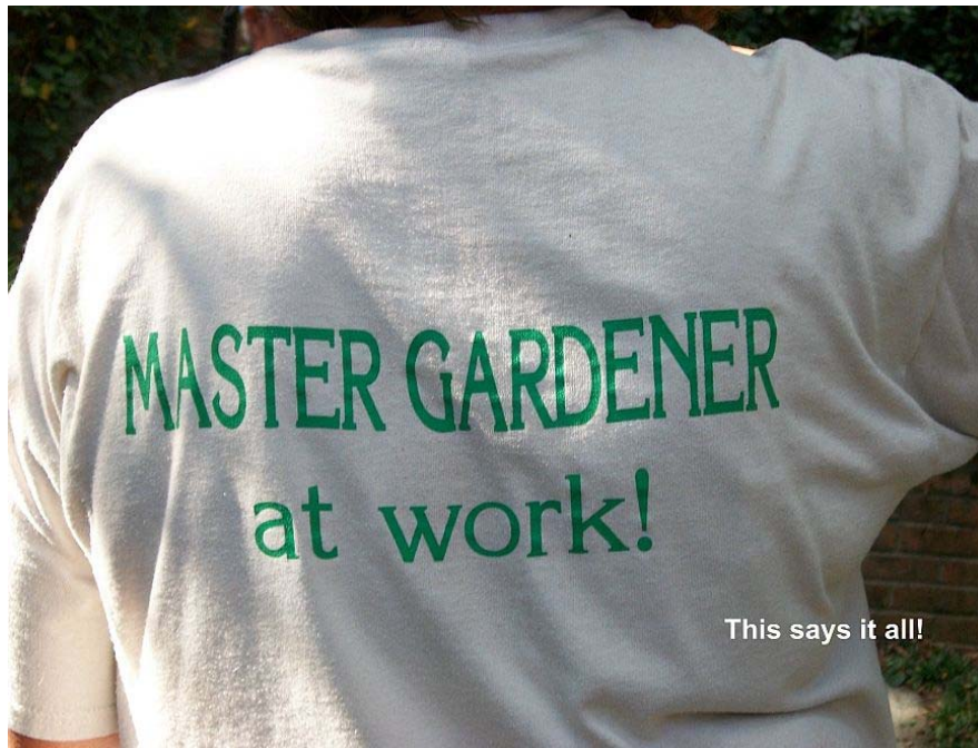
This says it all!